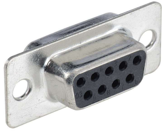
DB9F (female) with holes This female connector is attached to the joystick .