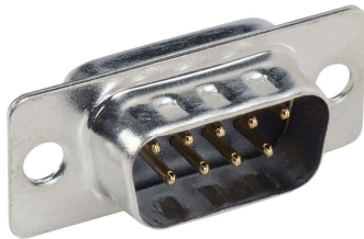
DB9M (male) with pins This male connector is used as the joystick socket on the transmitter .